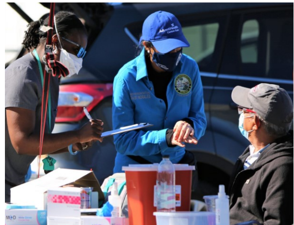
Jesus de Nazaret Episcopal Church Served 500 Residents | February 20, 2021