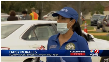
Orlando Vaccination Site Opens in Hopes to Reach Underserved Latino Population WESH 2 News