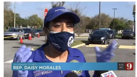
Residents in Orlando's Goldenrod Area Receive COVID-19 Vaccine