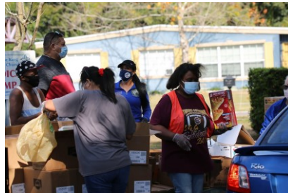
Christ the King Church Served 500 Families January 22, 2021