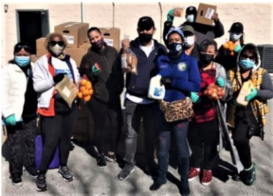
Tierra Nueva Church Orlando Served 250 Families February 3, 2021

My priorities include jobs, the economy and health care—and COVID-19 impacted all areas. District 48 was one of the hardest hit communities by the COVID-19 pandemic. I've worked tirelessly to ensure District 48 residents, received the food, medical supplies, and clothing they needed.