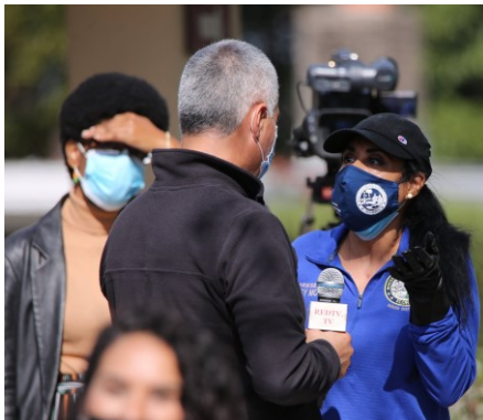
Food Distribution Red TV Florida