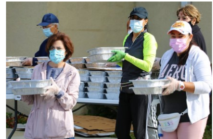
La Alianza Orlando Church Served 250 Families December 21, 2020

Once the COVID-19 vaccine became available, my team and I got to work touring other COVID-19 sites to learn best practices to establish vaccination sites in District 48 to give 1,000 residents this life-saving vaccine thus far. We've also secured two properties for 24-hour vaccination sites in District 48. I've also written two letters to Governor Ron DeSantis calling for a larger army of health care workers as more people are eligible for vaccination, and to authorize the two 24-hour vaccination sites.