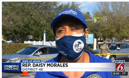
State Representative Daisy Morales Calls on Governor Ron DeSantis to Open More Vaccination Sites - WKMG 6