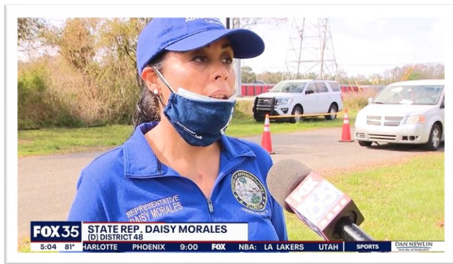
Lawmaker Calls for 24-Hour Vaccination Site FOX 35 Orlando