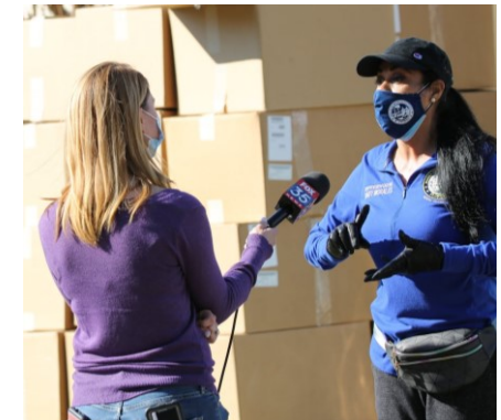
Food Drive-Up Event Serves 500 Families Impacted by Pandemic – FOX 35 Orlando