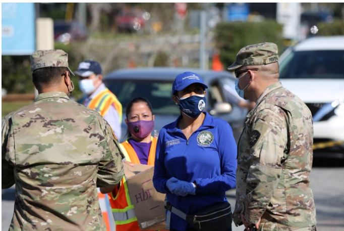
La Alianza Orlando Church Served 500 Residents | February 24, 2021

Once the COVID-19 vaccine became available, my team and I got to work touring other COVID-19 sites to learn best practices to establish vaccination sites in District 48 to give 1,000 residents this life-saving vaccine thus far. We've also secured two properties for 24-hour vaccination sites in District 48. I've also written two letters to Governor Ron DeSantis calling for a larger army of health care workers as more people are eligible for vaccination, and to authorize the two 24-hour vaccination sites.