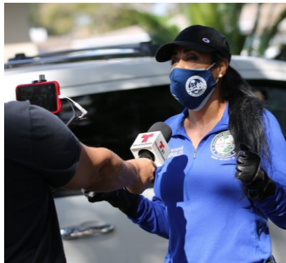
Food Distribution Telemundo 31 Orlando